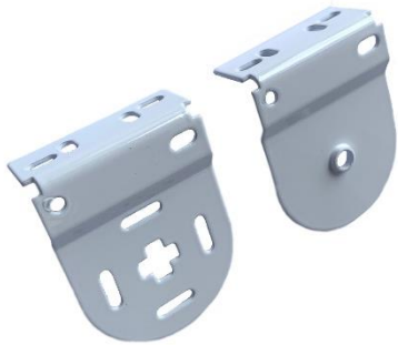
Child Safety P Clip